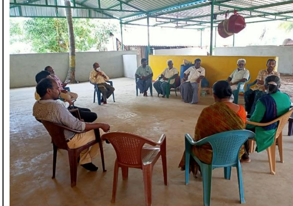
Meeting with the farmers at Sappanimadai