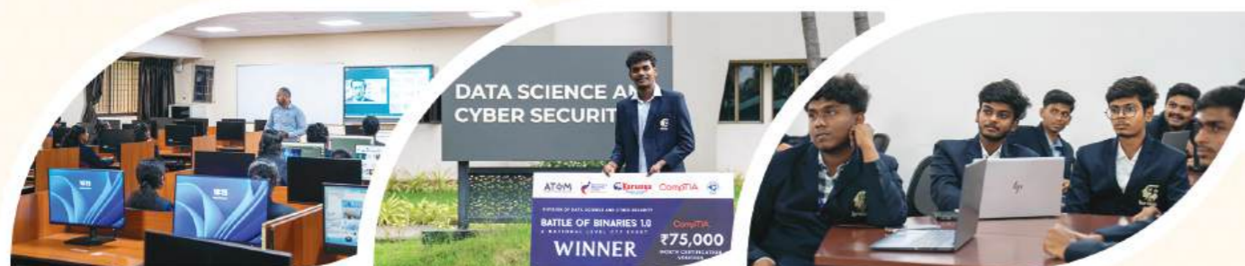
Data Science and Cyber Security

Our division is committed to not just keeping up with the advancements in AI, Data Science and Cyber Security but driving them forward. Received more than one Crore government funding from various agencies like DST and ICMR to solve human problems in the healthcare sectors. Immerse yourself in cutting-edge projects and contribute to the next breakthrough in technology through various research groups in our division.