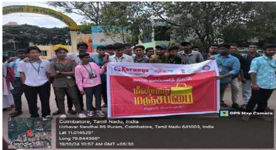
Image taken during the distribution of Manjappai to local people

To make awareness among people to use cloth bags (manjappai) instead of using non-degradable plastic bags, a campaign was arranged on 19.10.2024 at RS Puram Uzhavar Santhai, Coimbatore. NSS volunteers gave manjappai to each and every people in the farmers market and created awareness about the Meendum Manjappai app, which was established by the Tamil Nadu government. It helps to find out the location of the Manjappai vending machine and plastic bottle crushing machine. Students also went to the Perur local market and explained more about the importance for the usage of using manjappai instead of using plastics.