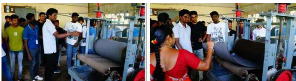
Awareness Programme for the Students on Reduced Paper Use and Recycling of Paper