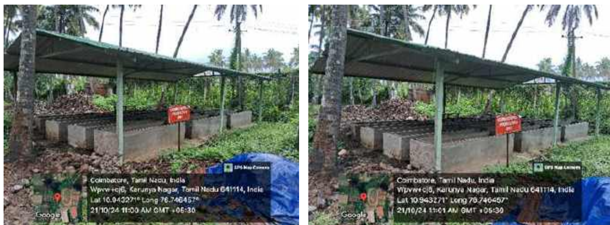
Commercial vermicomposting unit at the North Farm