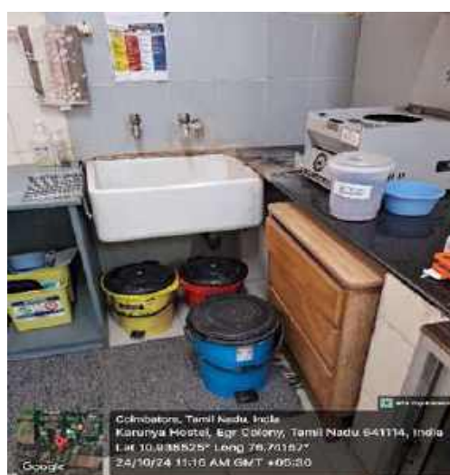
Collection of Biomedical waste