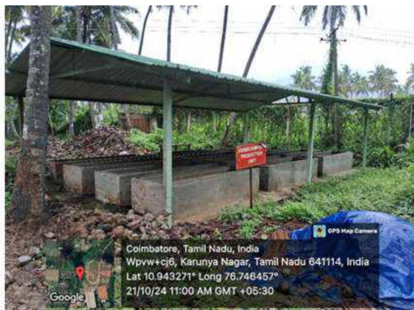
Vermicompost Unit in North farm-KITS

The crop residues, the dry leaves collected from hostels, garden, trees and other plants are recycled by Vermicomposting pits (4 Nos) in our Karunya farm. Nearly 4 tonnes of campus waste is recycled per year. Food waste generated in the campus is disposed of through a private vendor for his piggery units.