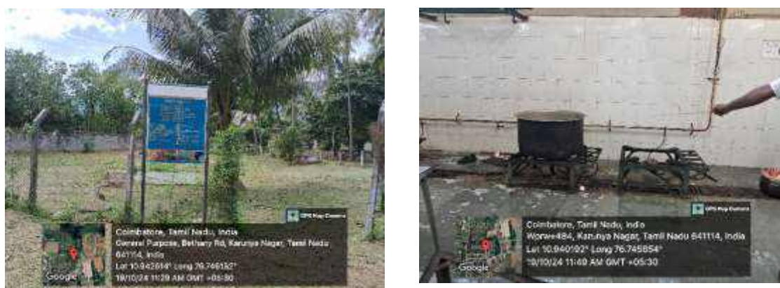
Biogas plant in residential unit at KITS