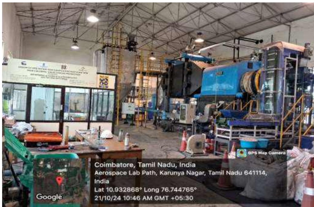
Plastic Gasifying unit at KITS

Cost : Rs. 6.12 crores, Duration: 2021-2024