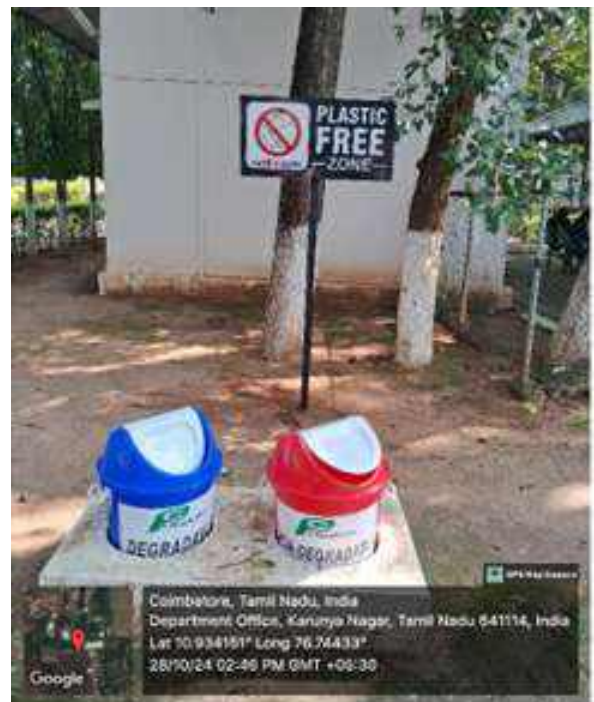
Sign Boards for Plastics