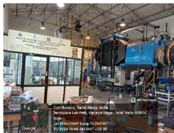
Plastic Gasification Unit at KITS