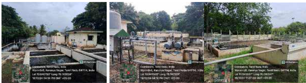
Sewage Treatment Plant