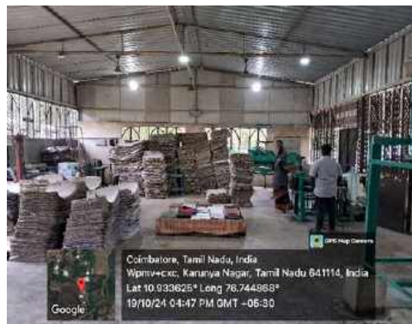
Paper recycling plant