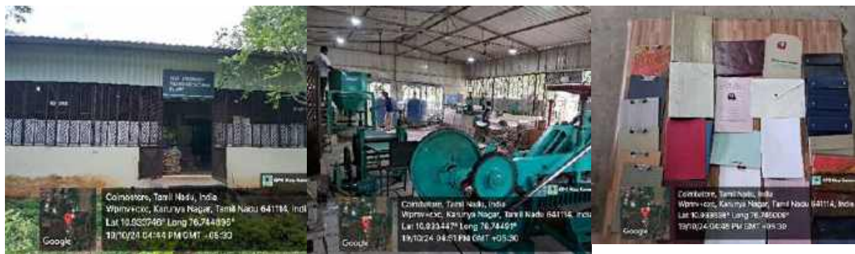
Paper Recycling Process and Production of New Stationary Product