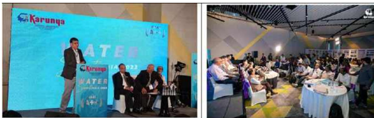
Use of Glass Bottles in Conferences