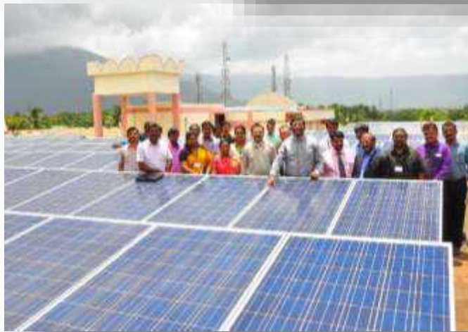
95 kW Grid Tied Solar Power Plant in Administrative Block