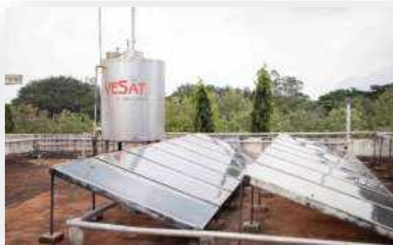
Solar Water Heater- Boys Hostel