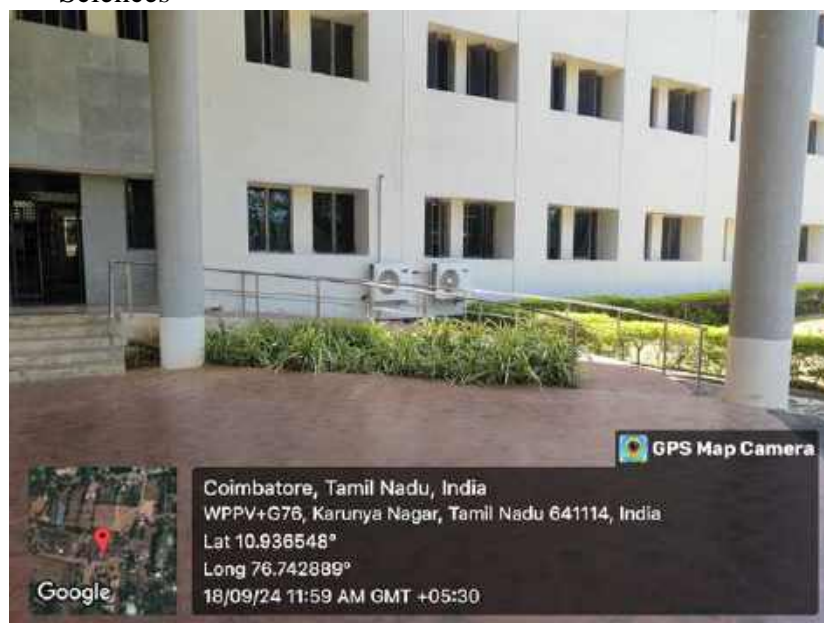
Ramp at the entrance of the ECE department