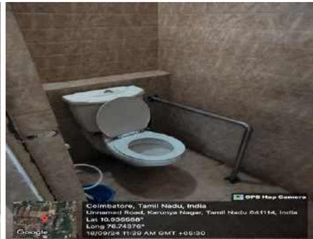
Lavatory at the administration block